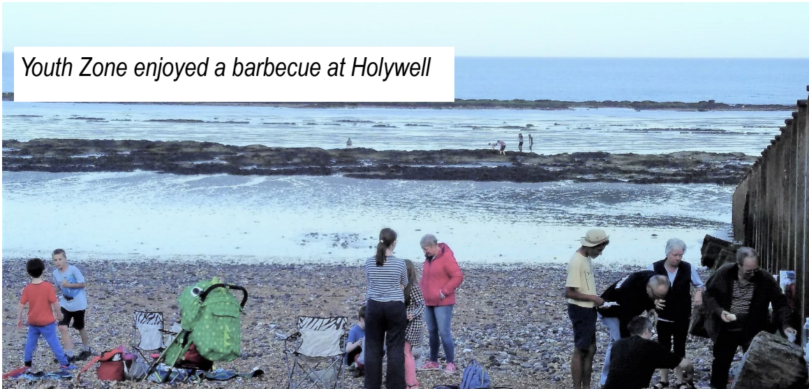
Youth Zone enjoyed a barbecue at Holywell